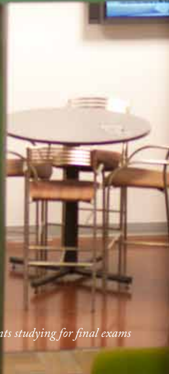
Top: A celebration for the 30th Anniversary of the NCCU School of Law Evening Program Bottom: Students studying for final exams